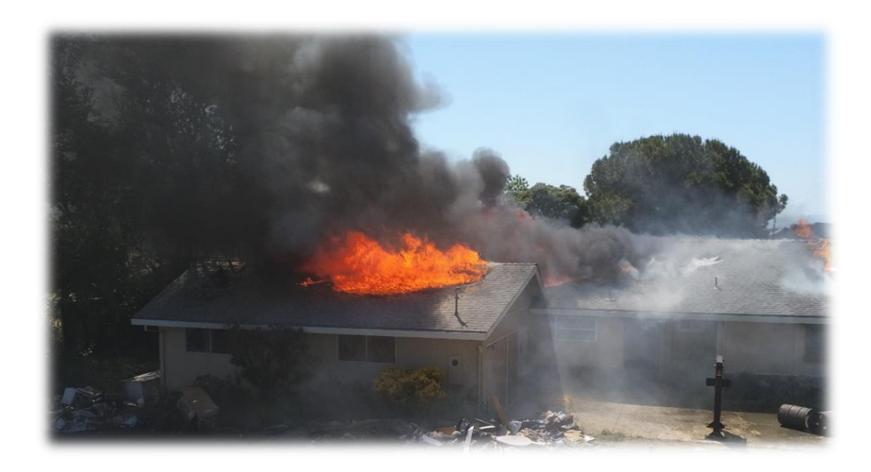
To host this course contact us at:

Students will be provided with a small practice drone to fly under the supervision of a pilot in command and instructor.